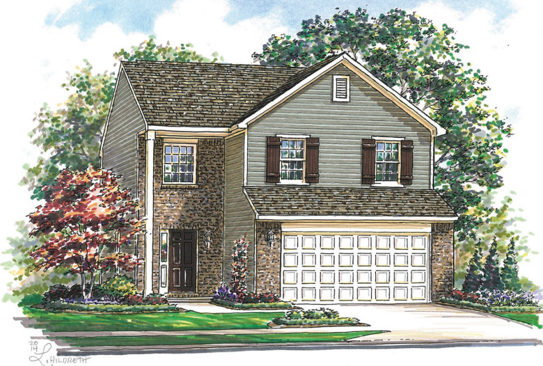
Elevation B (shown with optional brick, and board and batten shutters)

Elevation availability may vary by community.