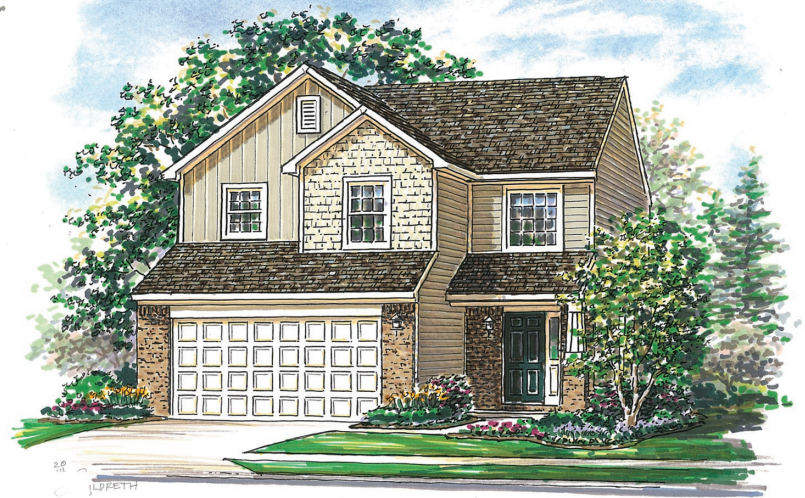
Elevation A2 (shown with optional brick, porch, craftsman column, shake siding and vertical siding)