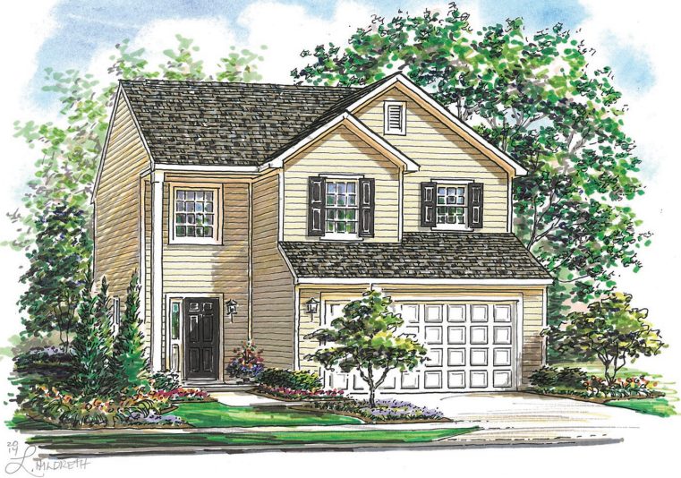
Elevation A1 (shown with optional shutters)